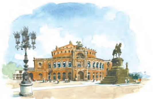
Semper Opera House

020 7593 2286 or email concierge@kirkerholidays.com